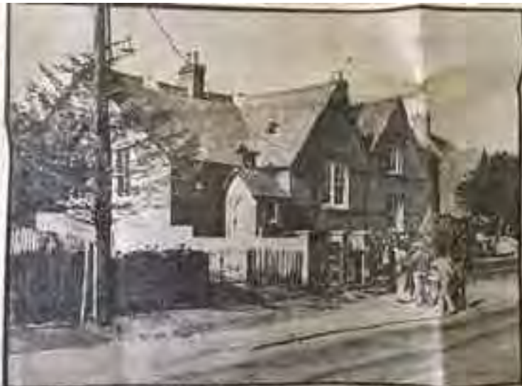
Our very own school: They tried to close it... but We saved it